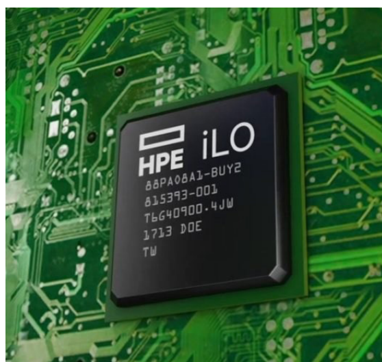
Figure 1. HPE iLO 7

Multilayer Silicon root of trust from HPE iLO protects servers from manufacturing to end of life and provides compliance readiness for future quantum-computing attacks.