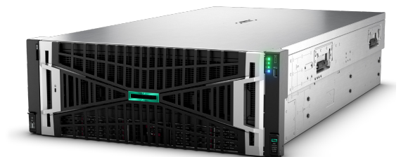
Figure 2. HPE ProLiant DL380a Gen12 server

Get the higher performance needed for new AI and edge workloads, and boost VDI efficiency—all while saving space and energy